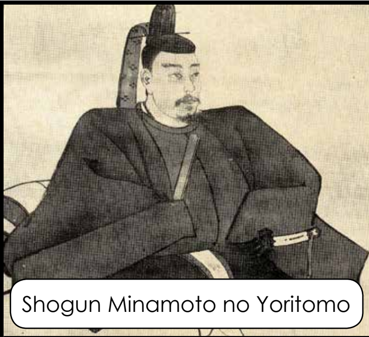
Shogun Minamoto no Yoritomo