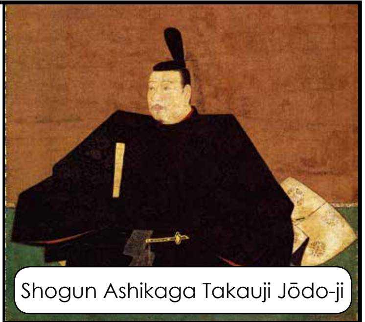
Shogun Ashikaga Takauji Jōdo-ji