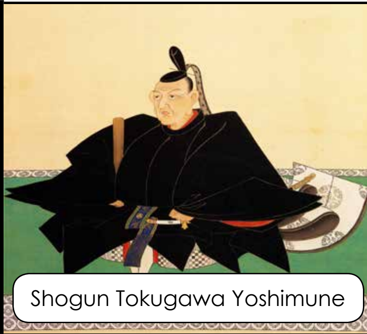
Shogun Tokugawa Yoshimune