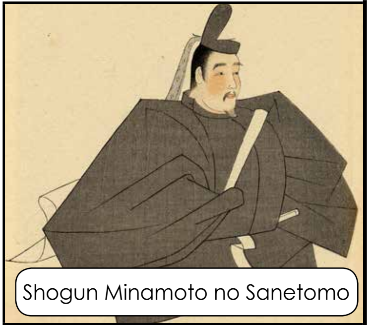
Shogun Minamoto no Sanetomo