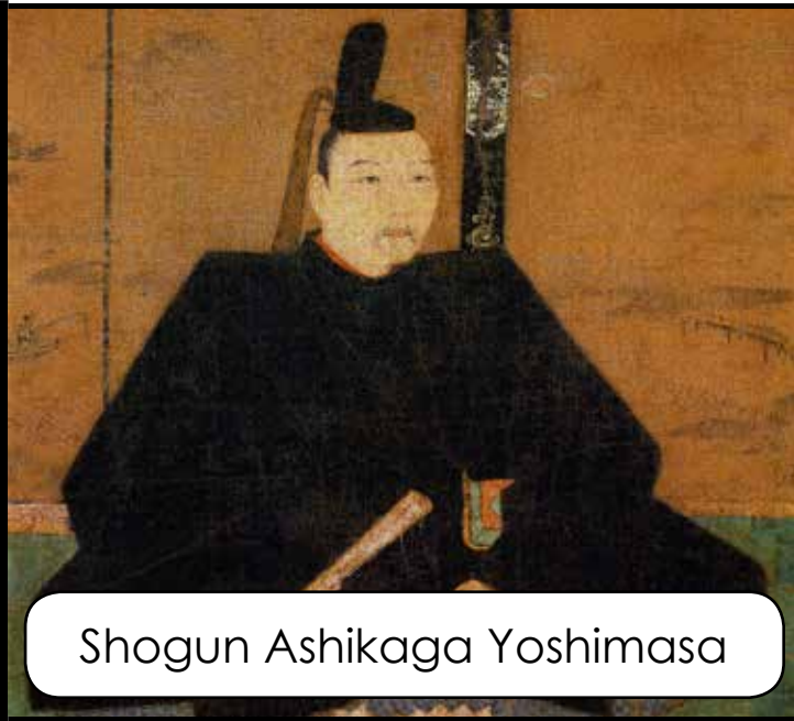
Shogun Ashikaga Yoshimasa